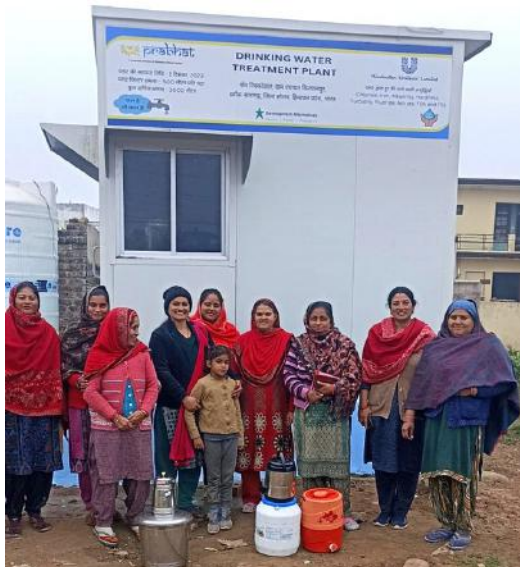
Jal Sakhi Samuh of WTP, Nikoowal village, Nalagarh

In the serene village of Nikoowal, nestled in the picturesque landscape of Nalagarh, Solan district, Himachal Pradesh, a quiet revolution was brewing behind the towering mountains. The community was grappling with a severe water crisis, with the quality of drinking water deteriorating perilously low. Development Alternatives, in collaboration with HUL Prabhat, decided to tackle this issue head-on, envisioning a brighter future for the villagers.