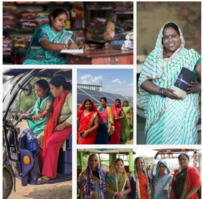
Champions of women empowerment

Development Alternatives' extensive experience in entrepreneurship programmes has made it evident that improved representation of women in decision-making