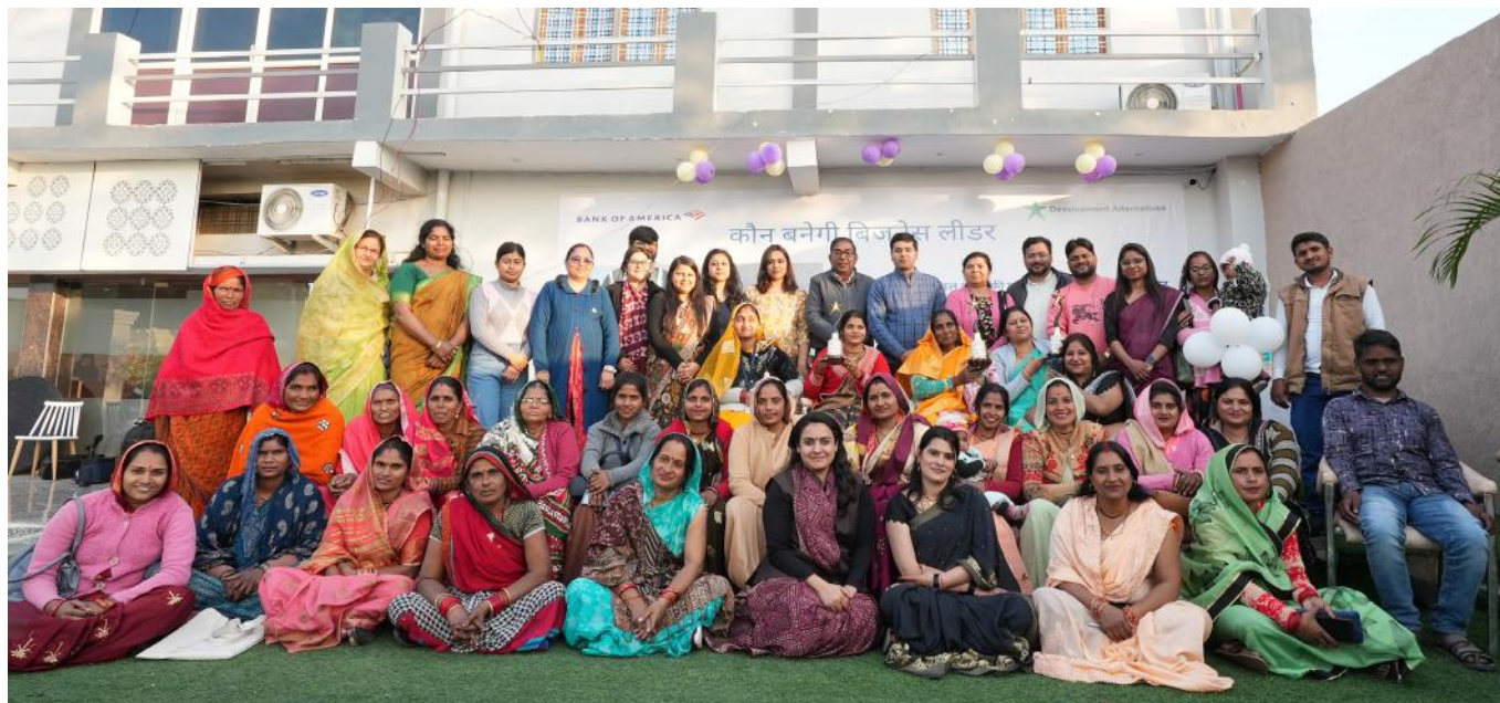
Group picture with all the pitch presenters, winners, jury members and representatives, from Development Alternatives and Gram Vaani during the KBBL finale event