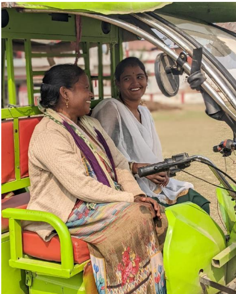
Safe mobility for women: a dream turning to reality

Evidence from the programme indicates that some women who once hesitated to leave their homes are now driving 10–12 hours daily. They have established partnerships with five schools, offering secure transportation for students. Teachers have expressed a sense of security, knowing the children are in safe hands.