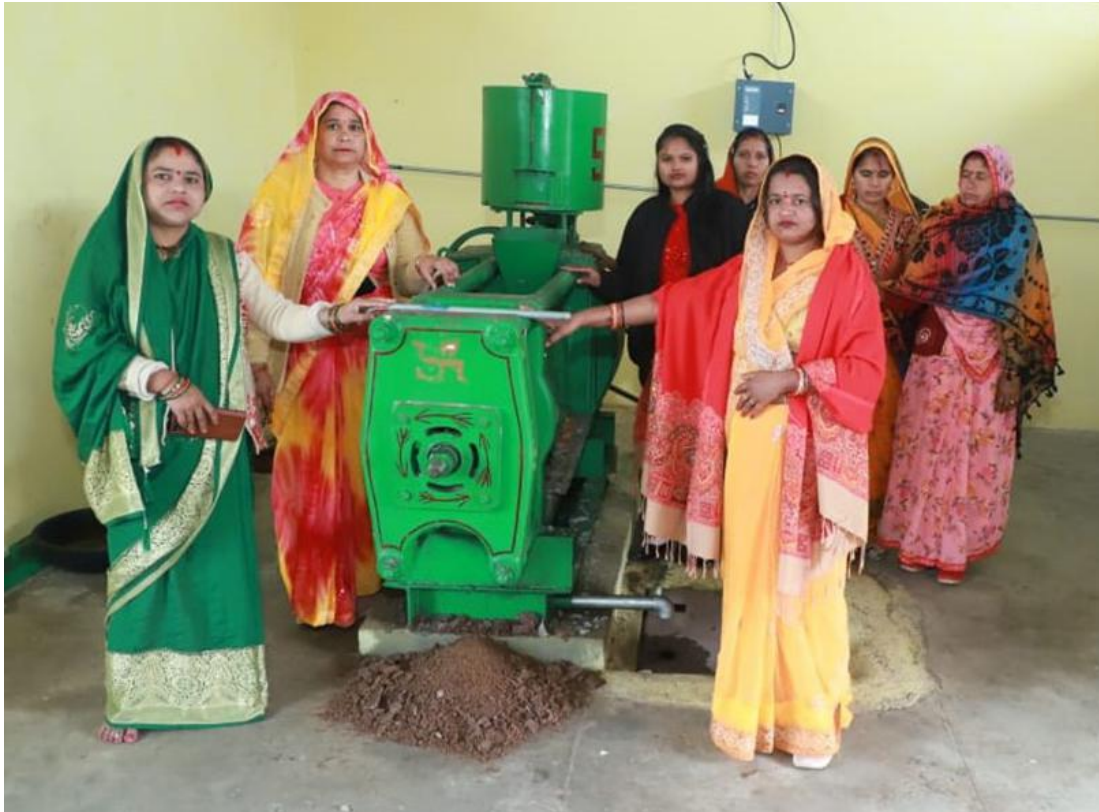
The women associated with shakti kendra in Jhansi