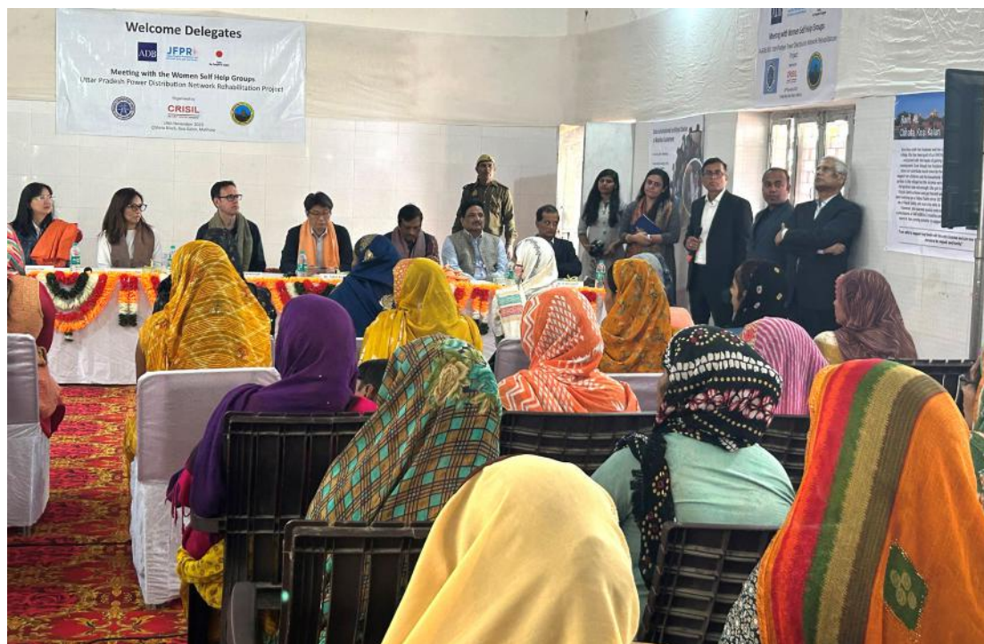
Different stakeholders collaborated to ensure the strengthening of SHGs as bill collection agents leading to an inclusive innovative model of last mile delivery of services in Uttar Pradesh

The recent budget has set ambitious goals for women-led development in the nation. Amidst other women encouraging announcements, one is to increase the target of the Lakhpati Didi scheme. In the interim budget 2024–25, the Union Minister announced that the goal of the scheme is to create 3 crore ‘Lakhpati Didis’ (prosperous sisters) in villages across the country. These women will earn a sustainable income of at least Rs 1 lakh per annum per household. This scheme was tested in Rajasthan, where it was launched in December 2023, and so far, as per the state government estimate, 11.24 lakh women have benefitted, creating hope for millions [1].