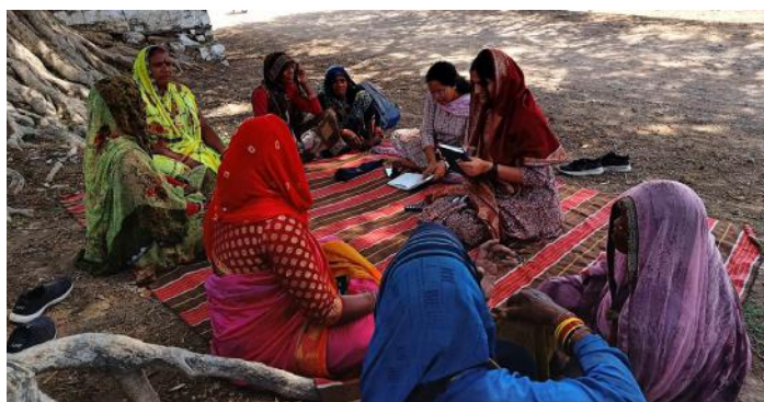
Group discussion on sustainable farming and water management with the dedicated women members of the Pond Rejuvenation Committee in Mudara Village, Bundelkhand.

India, as a pivotal force in the fight against climate change, has covered new grounds during its G20 Presidency in 2023, building upon its green agenda at the earlier UNFCCC COP 26 wherein the Hon'ble Prime Minister introduced the concept of 'LiFE – lifestyles for the environment'. The G20 members unanimously adopted the 'High-Level Principle on LiFE – lifestyles for sustainable development' in the Green Development Pact in the G20 Leader's Declaration 2023. The Green Development pact, lays, emphasises on climate change, just energy transitions, biodiversity conservation, and combatting plastic pollution, and can provide a green pathway to the UNFCCC COP 28.