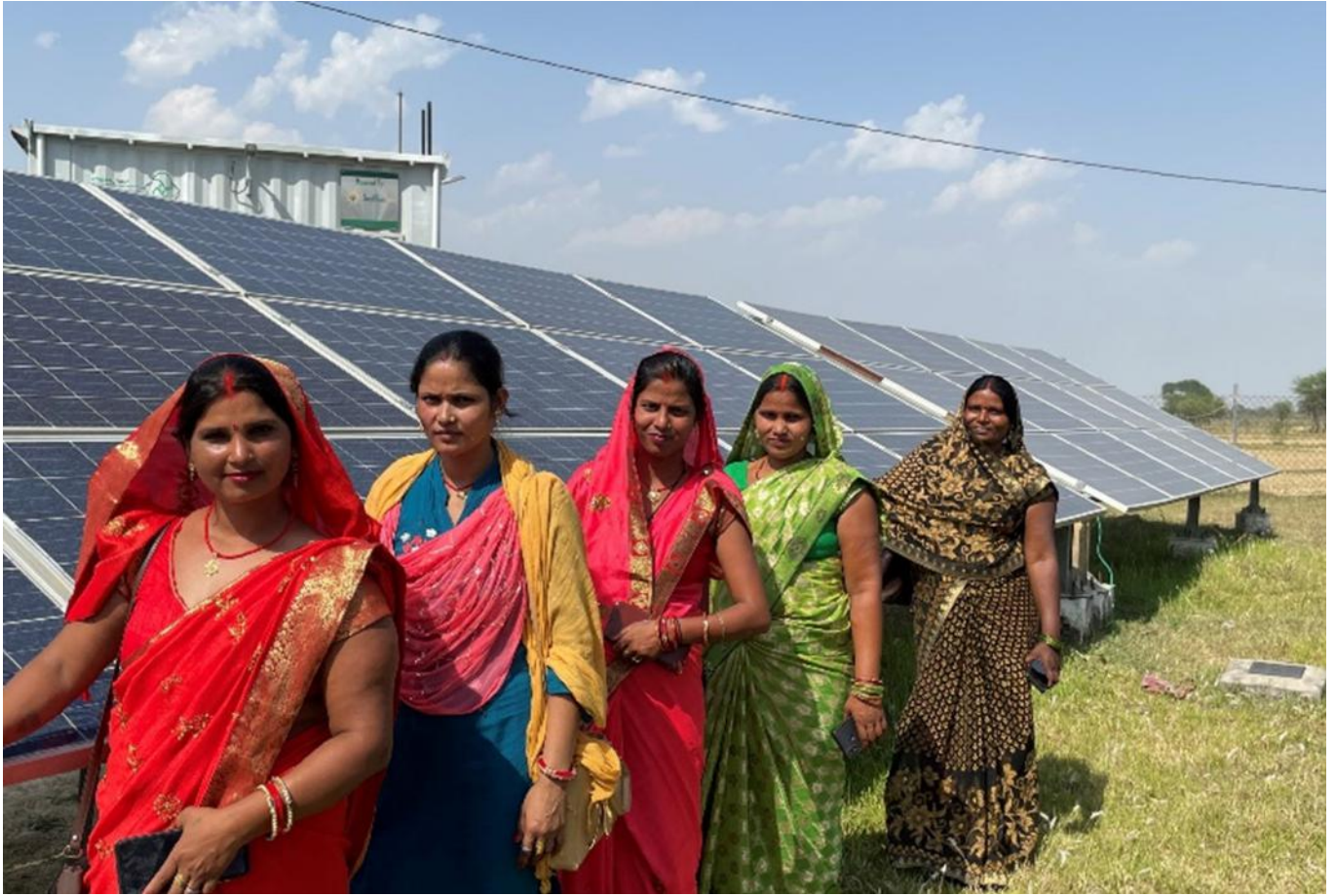
Women leading the pathway of green entrepreneurship to build robust local economies

Over the past few decades, rapid economic growth has presented an opportunity to address challenges such as deepening inequality, lack of social cohesion, environmental degradation, and concerns about the exclusion of diverse population groups. The pandemic has further triggered the most severe crisis in decades and resulted in a setback in progress towards equitable access to decent work, exacerbated by rising inflationary pressures, policy uncertainties, and persistent labour market challenges.