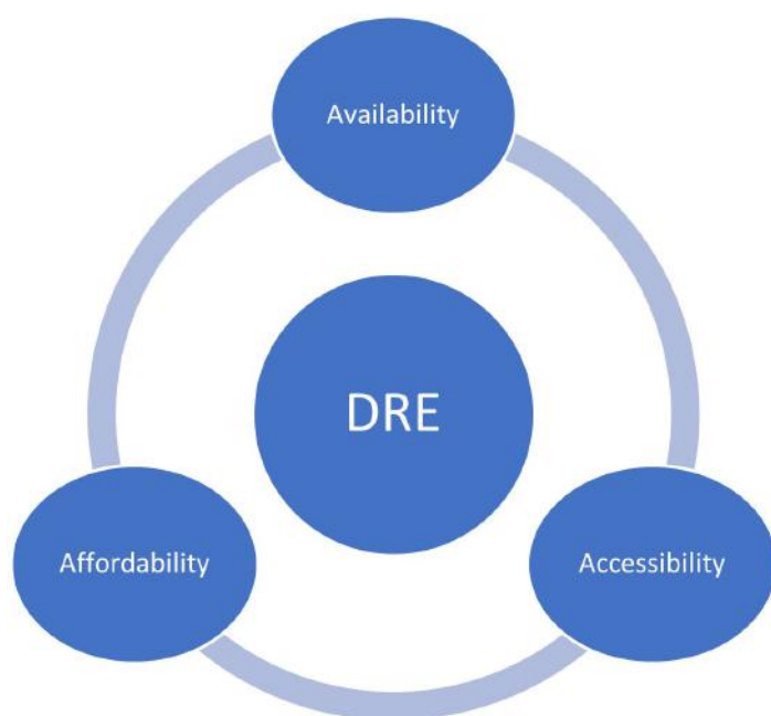
Potential of DRE applications

disparity. DRE applications are best suited to bridge the energy divide fairly quickly without undesirable trade-offs and social–environmental costs. Localised control mechanisms and self-reliance complement energy use at the last mile. Cost-efficiency in terms of payback and cost-effectiveness in terms of investment scale are both favourable for DRE technologies, thus enhancing the affordability quotient. With their lower footprints, DRE applications