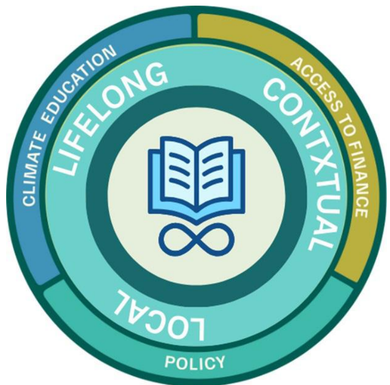
Climate change education

Contextual and socially relevant CCE, when approached from a lifelong learning perspective, empowers individuals and communities to adapt to the challenges of climate change while shaping a more sustainable future. By fostering resilience, unlocking climate finance, and driving informed policy discussions, CCE plays a pivotal role in building a world where climate change is not a barrier to progress but an opportunity for innovation and sustainable transformation. □