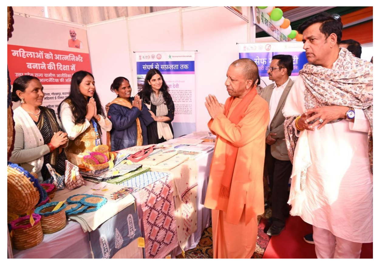
Hon'ble Chief Minister of Uttar Pradesh Yogi Adityanath and MP Ravi Kishan meeting with women e-rickshaw entrepreneurs

DA's efforts include activating dedicated district-level platforms to create a community of e-rickshaw entrepreneurs. By leveraging Cluster Level Federations (CLFs) and converging with government initiatives like Lakhpati Didi and Aajeevika Grameen Express Yojana (AGEY), the initiative ensures continuous support for women entrepreneurs through training, financial assistance, and market linkages. Technology solutions and data management systems will further enhance the programme's scalability and impact.