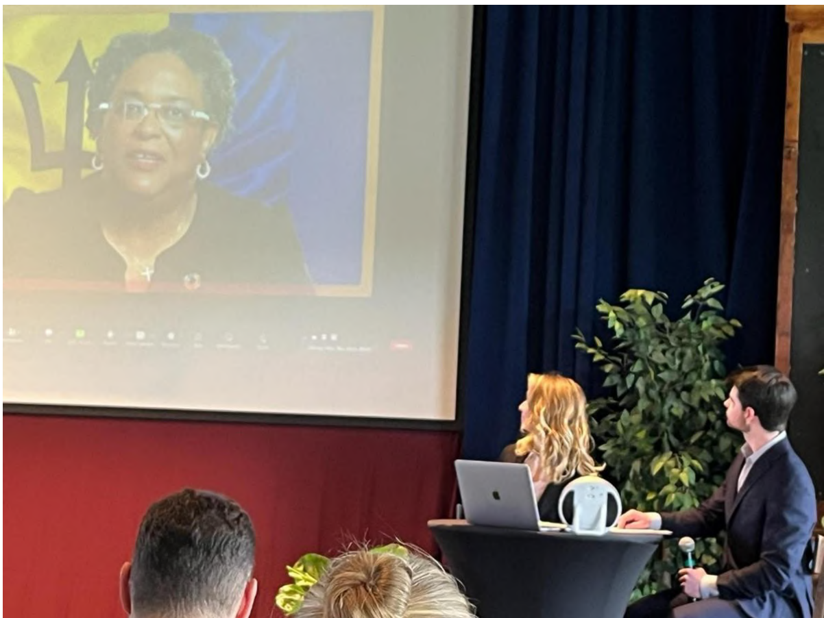
Live interview with the Hon'ble Mia Mortley, PM Barbados interviewed by Middlebury College students