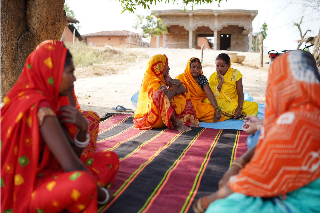
Meeting in session at Kajal Mahila Swayam Sahayata Samuh, Sonbhadra district, Uttar Pradesh