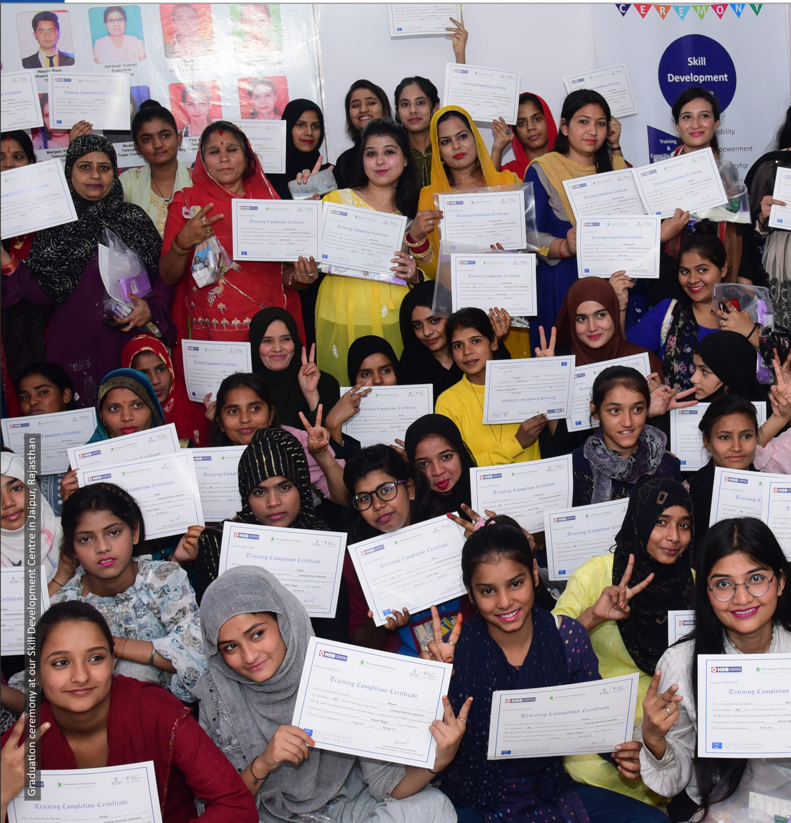
Graduation ceremony at our Skill Development Centre in Jaipur, Rajasthan

Growth and Beyond through Capacity Building