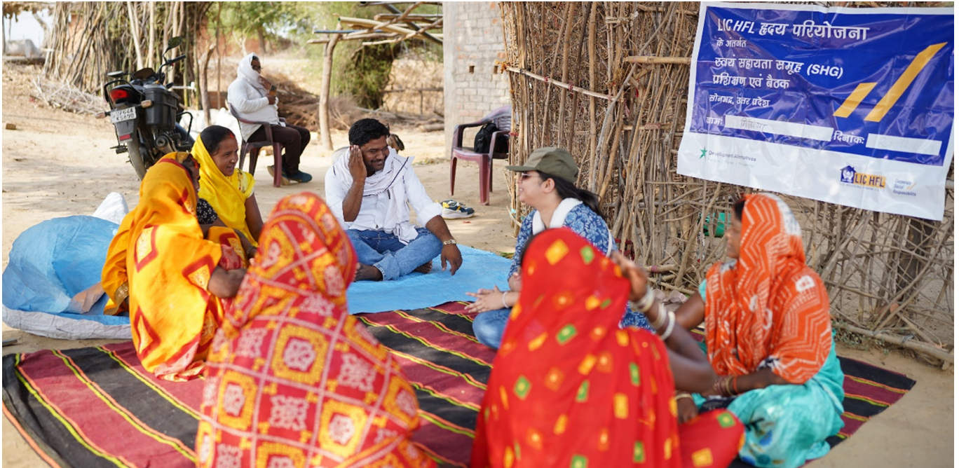
Community listening session in Sonbhadra district, Uttar Pradesh

D evelopment Alternatives has been creating a knowledge-sharing ecosystem in the Bundelkhand region through its community radio initiative, Radio Bundelkhand. Launched in 2008, Radio Bundelkhand bridges the information gap by providing updates on schemes, scientific advancements and opportunities that are essential for the people in the region. This platform has been instrumental in helping individuals develop relevant skills and improve their livelihoods.