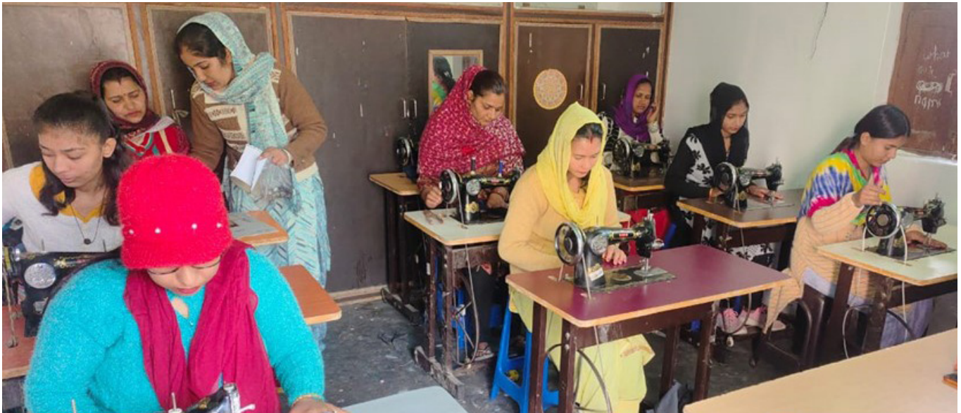
Tailoring classes at Mukimpur, Haryana

The twenty-first century presents a significant transformation opportunity for India. With the goal of becoming a net-zero carbon economy by 2070 and energy independent by 2047, the hundredth year of Indian independence [1], India has identified energy transition and climate action as key priority areas. A holistic green growth model, powered by innovation and entrepreneurship, will be the pathway for India to truly succeed in this transformation.