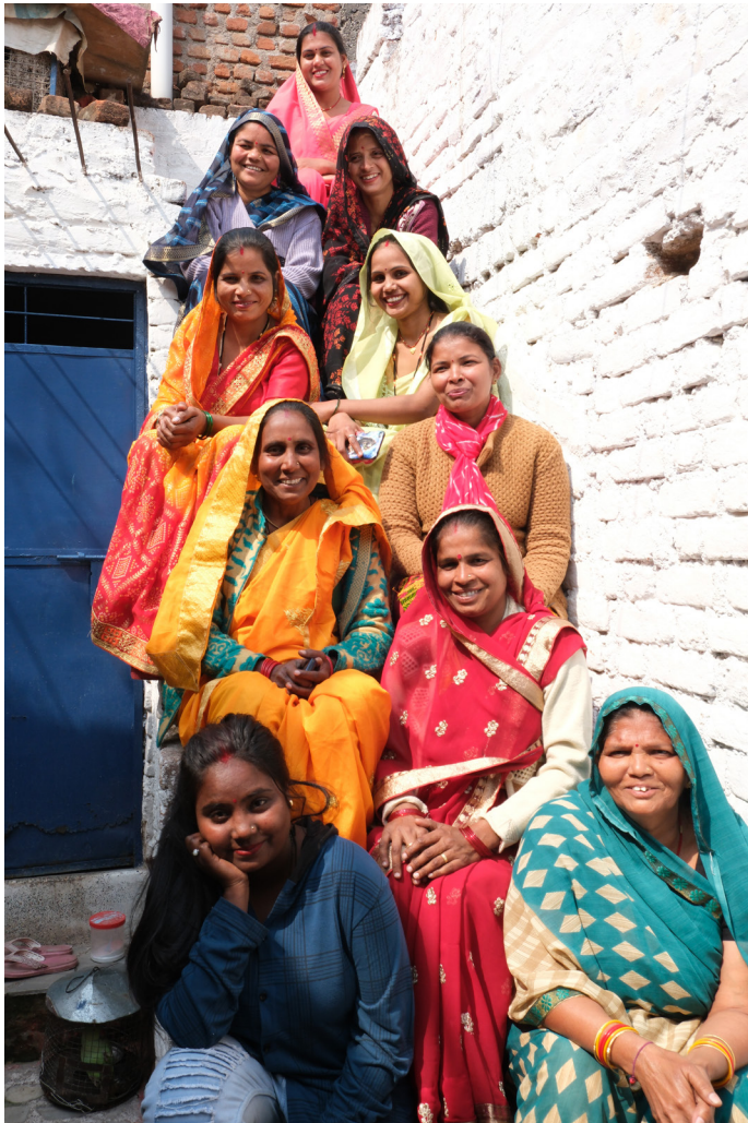
Skilling of women leads to their economic empowerment

For India to fully realise the potential of its youth and women through skill development, several steps are essential: