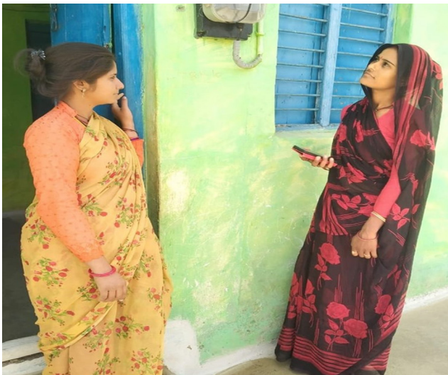
Bill collection by our vidhyut sakhis

Collaborating with local businesses creates internship and employment opportunities for women who complete their training. With places having access to internet, online courses can compliment in-person training. For example, in Lalitpur, the Fayedde Ki Ghanti programme provided solutions for functional literacy, women empowerment and digital and financial literacy. To ensure women have access to digital literacy, training can open numerous opportunities for remote work and expand their employment options. Regularly assessing the impact of training programmes and seeking feedback from participants helps refine and improve these initiatives. Sapna, a 30-year-old resident of Nanaura village, exemplifies the success of these programmes. Initially uncomfortable with technology, she joined the Fayedde Ki Ghanti classes and gained confidence with these gadgets. She then enrolled in a grassroots