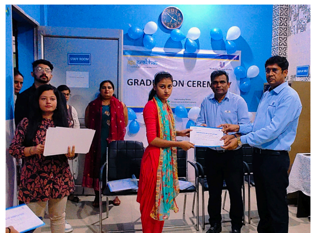
Graduation ceremony at Sonipat centre, Haryana

and knowledge without having to travel long distances. They are designed to be safe and culturally sensitive environments, offering courses in various skills such as tailoring, beautician, computer literacy and entrepreneurship. It is crucial to engage community leaders and families in order to gain support for women's participation as community awareness campaigns help shift societal attitudes towards women's education and employment. Additionally, offering training sessions at different times of the day accommodates women's responsibilities at home, with evening or weekend classes being particularly beneficial.