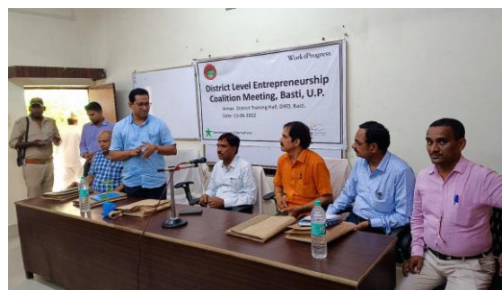
Officials interacting with entrepreneurs

The inception meeting was headed by the Chief Training Officer of Basti district and officials from six other government offices, namely, Rural Self Employment Training Institutes, SBI Bank, District Training Department, District Development Board, Horticulture Department and Veterinary. Representatives from women federations and entrepreneurs also attended the meeting and highlighted the barriers to pursue entrepreneurship at the rural level. The officials from various departments and the community representatives agreed on a need for a collaborative platform to monitor and streamline the various schemes available for livelihood creation.