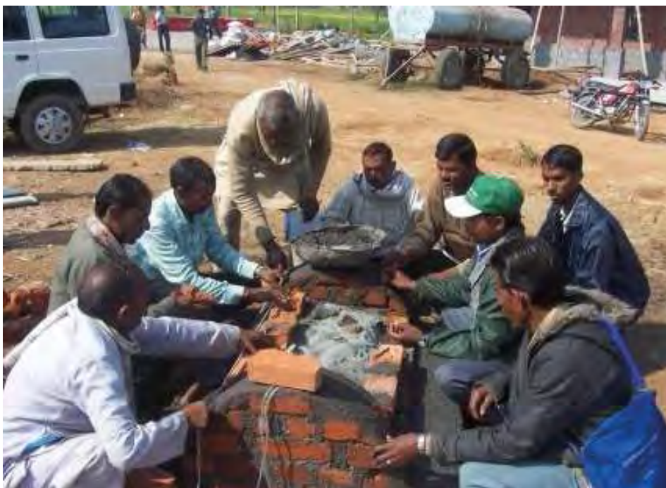
Figure 203—TARA Karigar Mandal (TKM) mason guild, Bundelkhand training in green construction technologies.

At this same time, the above experience was reiterated in Azadpura, a small village in Orchha in Madhya Pradesh where IAY funds (INR 14 000 per family) were used in 1995 for the in situ development of eco-friendly housing led through design and technical support by TARA Nirman Kendra, a building centre of DA but largely managed through community participation. This creation of customised houses, using alternative construction technologies, with the production of materials in the village and the upgrade of local skills was repeated in small ways across the county by various members of the basin-South Asia and other civil society organisations. This experience was repeated in the same region, in the village of Madore, where an additional component of credit and local skills through TKM (a cooperative of artisans collective trained in eco-construction) provided construction services to a community-led habitat development initiative. Madore village provided the initial lessons of a ‘systems approach to rural habitat’ and became a case example for the Madhya Pradesh state government in its endeavour to design a state-led housing social housing programme, the Mukhya Mantri Awas Yojna (110) .