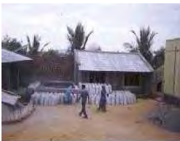
Figure 204—A typical village enterprise producing and supplying roofing tiles and providing a roofing service