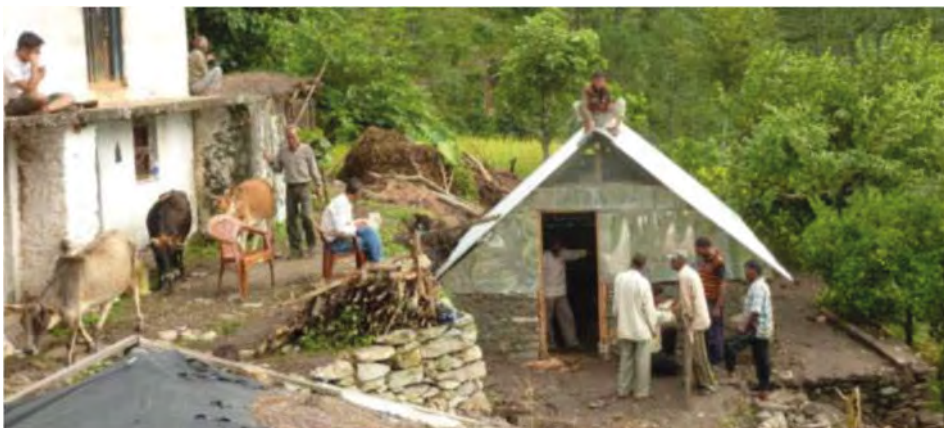
Figure 206—A semi-permanent house under construction in Uttarakhand