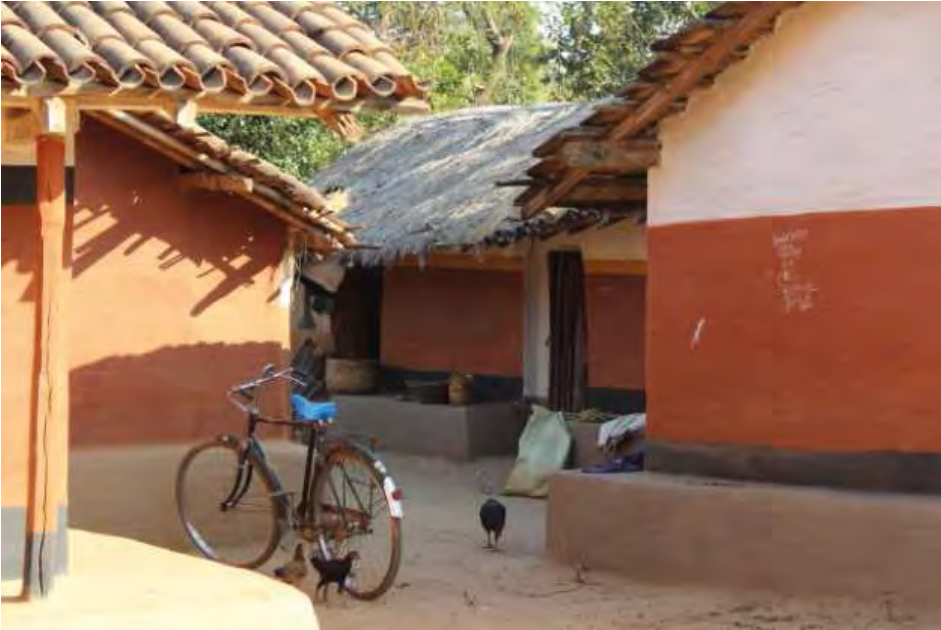
Figure 207—Traditional homes in Mayurbhanj, Orissa. Can centralised IAY lead to strengthening rather than replacing the cultural aesthetic of our folk housing?

Disaster resilience as a measure of quality: What one does that measure, one does not address. It is important that vulnerability assessments followed by measures of disaster resilience are integrated in rural housing measures. Needless to say that a participatory process for is required for this to be internalised by the communities. Even within the social housing focus, the new guidelines fall short with respect to assessing, measuring and mitigating risks due to natural phenomenon. One of the biggest gaping holes is that ‘disaster resilience’ is not even in the list of items to be monitored for quality.